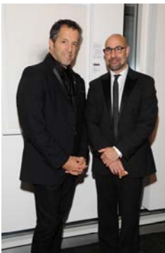
Kenneth Cole, Stanley Tucci