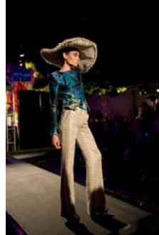
Christian Siriano Fashion Show