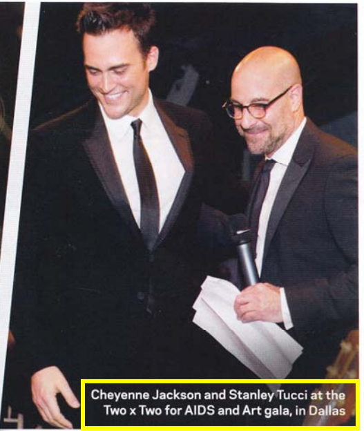
Cheyenne Jackson and Stanley Tucci at the Two x Two for AIDS and Art gala, in Dallas