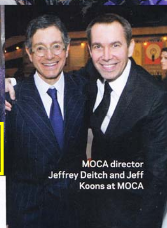
MOCA director Jeffrey Deitch and Jeff Koons at MOCA

PHOTOGRAPHS BY STEVE FOXALL, BRUNO, KRISTINA BOWMAN, DALLAS; GETTY IMAGES, LOS ANGELES; GENEVIEVE DE MANIO, BOSTON; MICHELE HINZ, PHOENIX