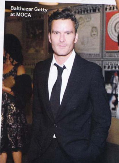
Balthazar Getty at MOCA