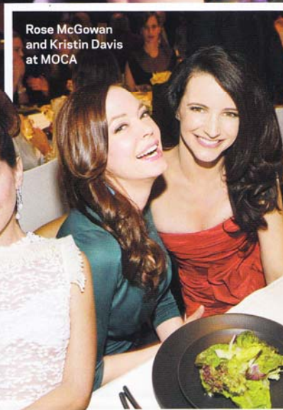
Rose McGowan and Kristin Davis at MOCA