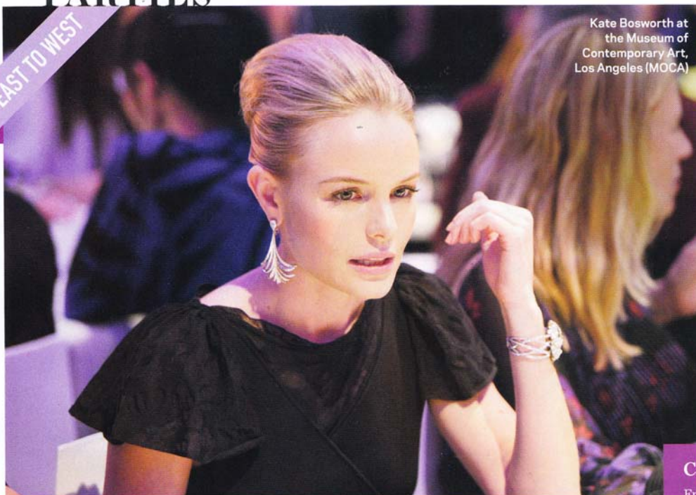
Kate Bosworth at the Museum of Contemporary Art, Los Angeles (MOCA)