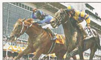
By Gary Hershorn, Reuters

In the heart of bluegrass country, Keeneland spells high tradition unlike any other racetrack in the USA. "Its impeccably kept grounds, with ivy-covered stone buildings and handsome spectator areas, are set among beautiful groves of oak and sycamore," Smith-Baranzini says. "The surrounding countryside is checked with some of the most prestigious horse farms in the country." Racing seasons are each April and October. 800-456-3412; keeneland.com