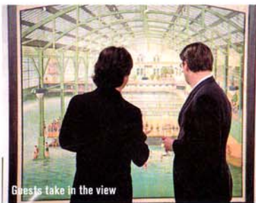
Guests take in the view